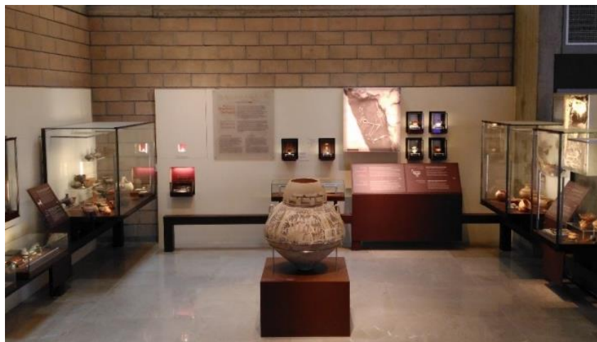
Figure 3: A Bronze-Age ceramic jar pithos, original archaeological object in the Archaeological Museum of Thebes, is appropriate for a SEI. The results of the archaeometric research conducted by the Fitch Laboratory of the British School at Athens were used to design a SEI and the educational program.