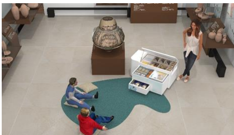
Figure 4: The formation of an educational environment around the museographic structure of a SEI. The mobile part of the museographic structure of a SEI surrounds the exhibit. It consists of three parts respectively of the three methodological scientific stages: a. formulation of research questions, b. examination of scientific hypotheses i. macroscopic way and ii. microscopic way, c. conclusions

The mediating object (e.g., the Bronze Age ceramic jar in Figure 3) is thus complemented by a proposal to design an appropriate space for the realization of the educational program. In Figure 4, an example of such a setting is shown to host a small group of primary school pupils to participate the educational program.