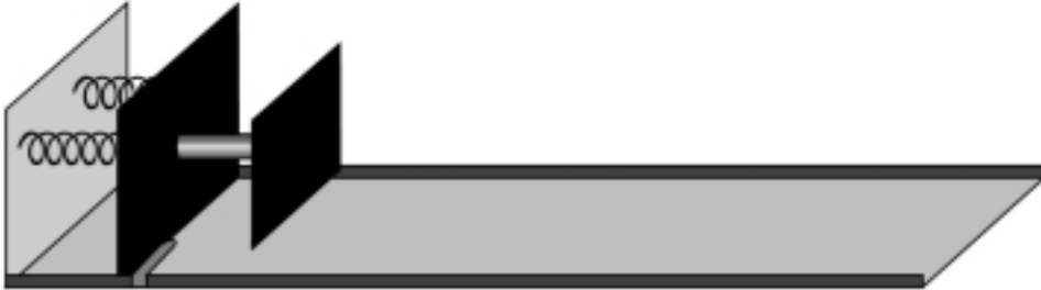
Figure 1. The projecting apparatus.

children 34 were assigned to the experimental group and 34 to the control group. Children were grouped by age and cognitive ability according to their responses to the pre-test. All children had already attended 1 year in kindergarten, and had become familiar with teaching interactions taking place in the classroom setting. All children could use the concept of distance ('far–near') without difficulty.